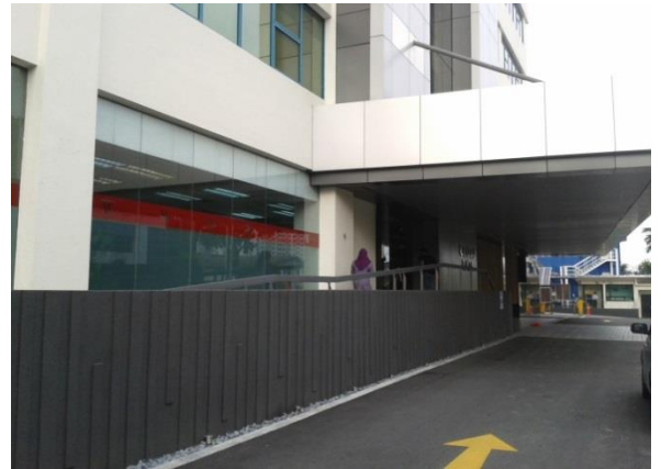
Drop Off Area