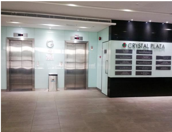
Ground Floor Lift Lobby