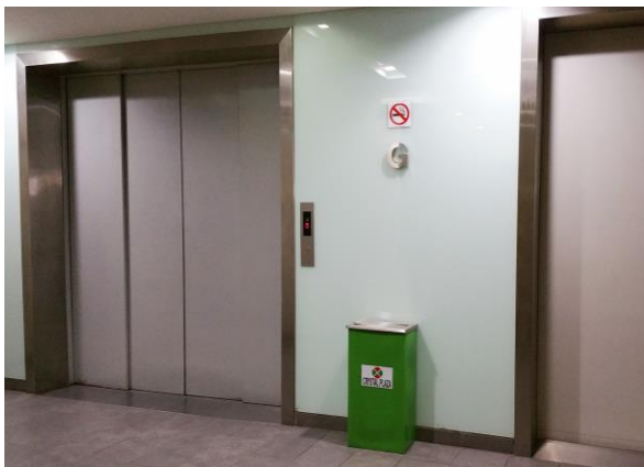
Cargo Lift Lobby