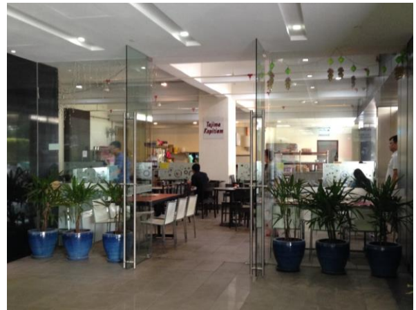
F & B Area at Ground Floor